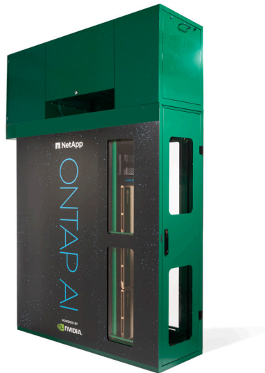
Figure 1) ONTAP AI inside the DDC trademark green cabinet in a ScaleMatrix data center.